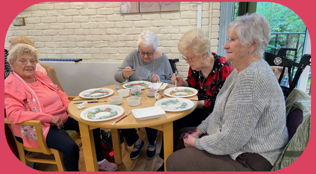
Christmas wreath making