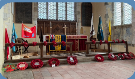
Remembrance Sunday at Warehorne Church

The aim of the Royal British Legion is to support ex-service personnel, but you do not need to be ex-military to belong.