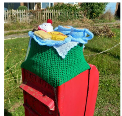
Created for Ruckinge by Sussan Owens