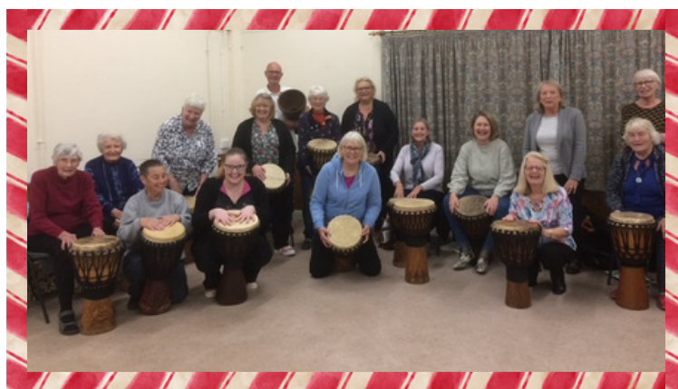
Drumming up some fun

The WI is open to all women, we meet on the second Monday monthly (no meeting in August) in Victory Hall, Hamstreet starting at 7.30pm. Come as a guest for 2 meetings, paying just £1.00 before becoming a member. The WI is a national organisation, existing to improve the lives of women and the things that matter to them. You can become involved at local, county or national level – the opportunities are there for you!