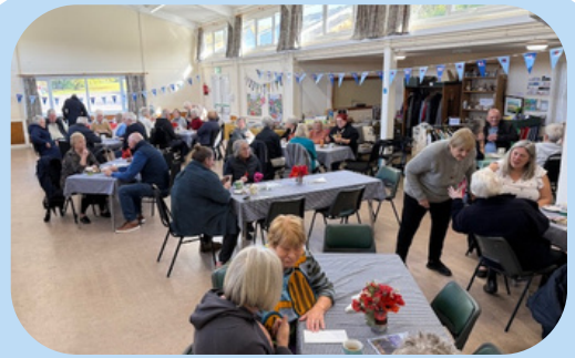
Annual Poppy Appeal coffee morning