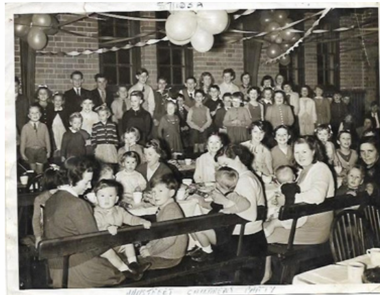
Hamstreet Christmas Childrens Party 1959

My wish to Father Christmas is for another Guest Editor to join our brilliant team. One of the editors is a Secondary school student – there must be more like him around. Good for a future CV and a small payment in your pocket.