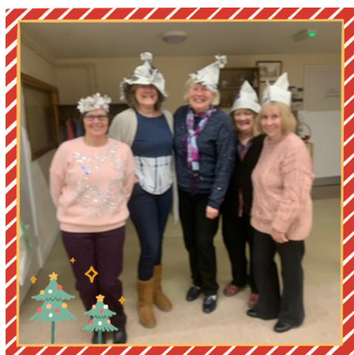
Christmas Party 2024

In January we celebrate 60 years of Orlestone WI , a very special anniversary, and we will welcome guests from other WIs to help mark the day. Our tradition in January is to run a free raffle which makes everyone a winner while we enjoy refreshments and fun activities together with a special birthday cake.