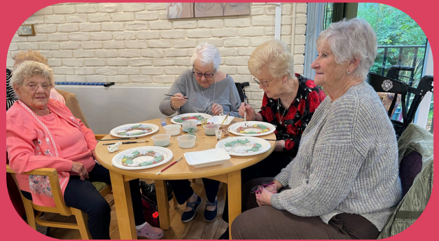
Christmas wreath making