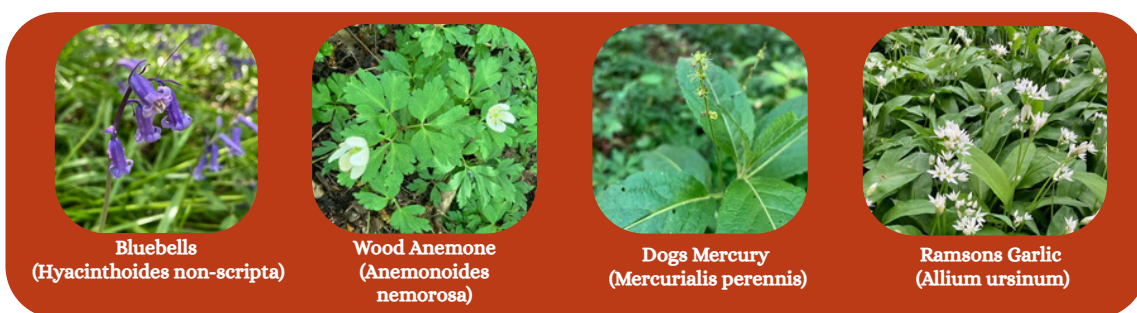
Bluebells ( Hyacinthoides non-scripta )

April really is the one of the most exciting months in the woods. After the hard work of managing the habitat, the sun starts to come out, the weather warms up, the ground flora starts to poke its head up through the leaf litter and the flowers begin to show. The wood is well known for Bluebells ( Hyacinthoides non-scripta ), with the amazing purple scented carpets throughout. Fun fact: their sticky sap was once used to bind pages in books and glue the feathers to arrows. We also have many more plants in flower at the moment. Why not have a wander in the woods and see if you can spot them.