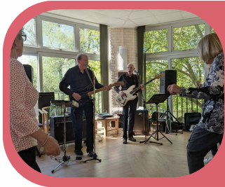
Chicory Tip had us all up and dancing to their No.1 Hit Son of my Father