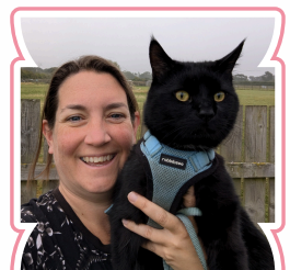
Myself with one of our travel cats at a campsite in York.