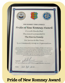
Pride of New Romney Award

29th May - A talk by Age Concern which is made up of independent charities all working together to provide crucial support for older people.