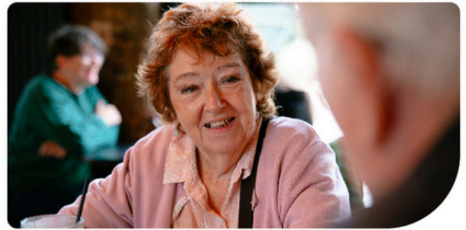
Parkinson's UK is the operating name of the Parkinson's Disease Society of the United Kingdom. A registered charity in England and Wales (26907) and in Scotland (SC038661).