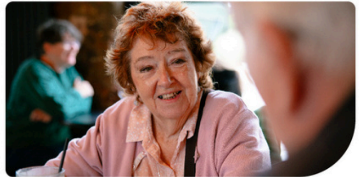
Parkinson's UK is the operating name of the Parkinson's Disease Society of the United Kingdom. A registered charity in England and Wales (281197) and in Scotland (SC031551).